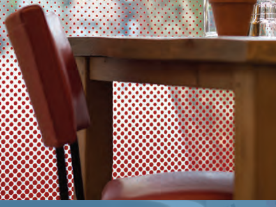
AVAILABLE FOR BRANCH EVENTS AND PARTIES