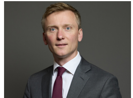
Pensions minister Torsten Bell

The speech concentrated on workplace rather than state pensions. But the WASPI issue was raised from the floor. While clearly not satisfying the questioner, Torsten Bell gave an undertaking that any major changes would be flagged up more thoroughly in future.